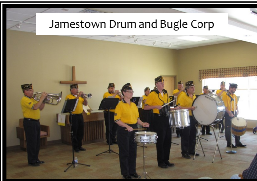
Jamestown Drum and Bugle Corp