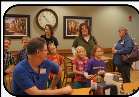
The Kulm First Graders joined the residents for the noon meal and sang Christmas Carols throughout

the Veterans Home. On February 21st the Kulm First Graders received some special visitors as the NDVH bus took a scenic drive to Kulm.