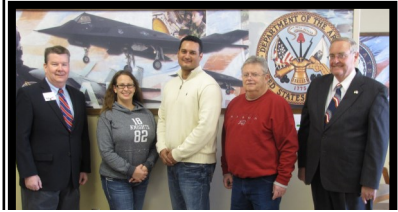
Air Force Association