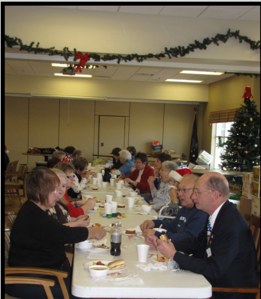
American Legion and Auxiliary Members enjoy a well deserved lunch following the gift shop.