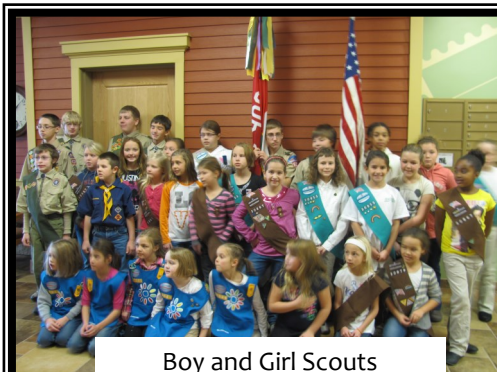
Boy and Girl Scouts