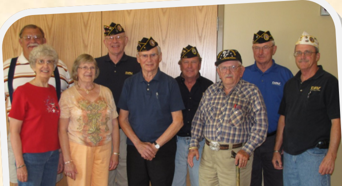
DAV Chapter #24 of Valley City sponsored a Saturday Bingo and served lunch.