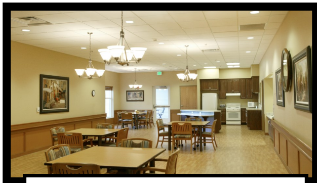
One of the twelve dining rooms of NDVH.