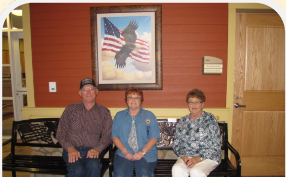
American Legion Auxiliary #163 of Wilton gifted NDVH with outdoor benches.