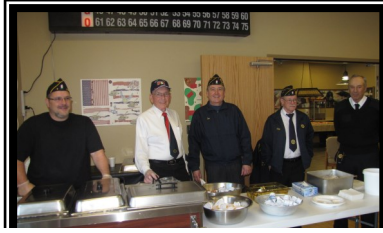
American Legion Post #7 of Lisbon