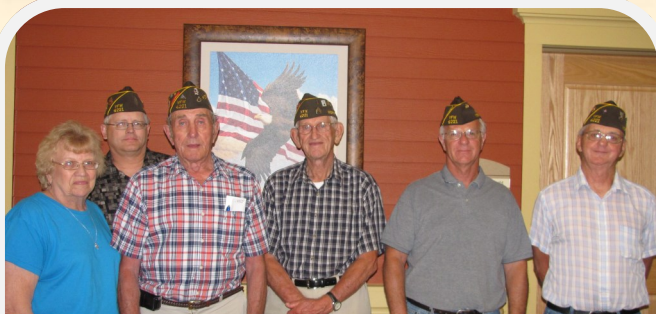
American Legion Post #70 of Hatton shared their generosity.