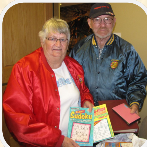
VFW Auxiliary #3444 of Dickinson presents gifts to NDVH residents.