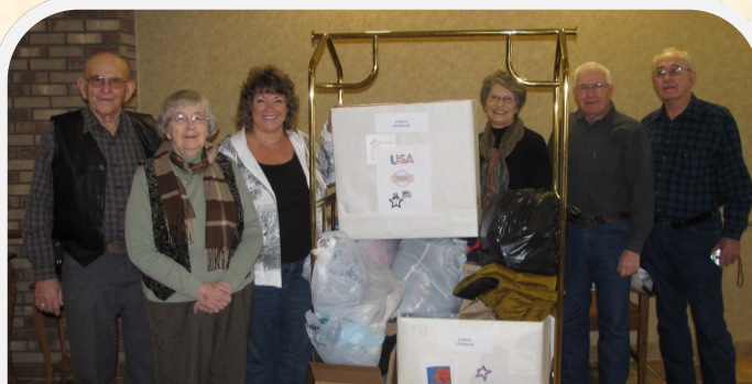
American Legion and Auxiliary #245 of Medina came bearing gifts.