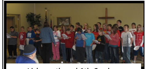
Lisbon 5th and 6th Graders

This year our week celebration included: